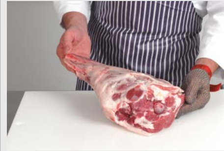
11. Carving leg – internal view.