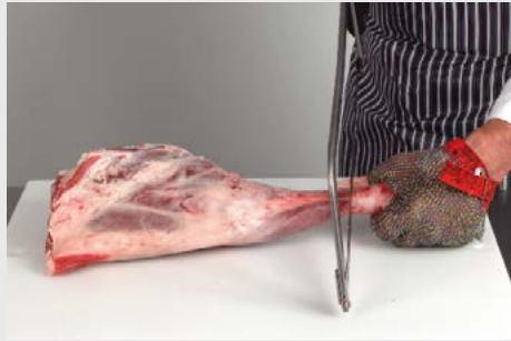
9. Remove knuckle bone.