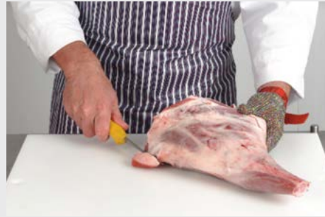
10. Trim off excess fat.