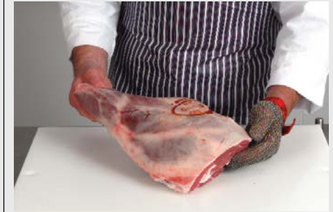
12. Carving leg – external view.